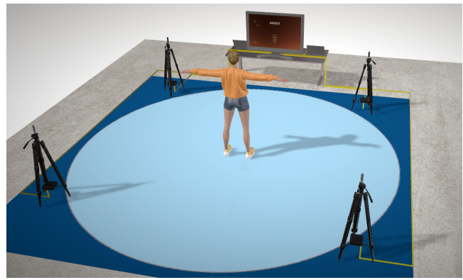
Figure 3: Four sensors perimetrically cover the capturing space where the user is placed watching and playing the game on a large screen.

In this demonstration, we showcase the aforementioned volumetric capture system and the newly introduced AVOIDX game, which is open-source and publicly available 1 . The full setup for the demonstration is illustrated in Fig. 3. Users are reconstructed in real-time and play the game using the volume of their own bodies. We use a 64 \times 128 \times 64 voxel grid resolution to achieve real-time rates, even with constrained processing ( i.e. laptop). The game's goal is to avoid incoming walls, which are carved with empty regions, indicating the poses that the users need to strike in order to safely avoid them. With respect to the game logic, the users earn points by successfully avoiding the walls and gathering virtual coins, while the top players of the game are shown on a leader board. In this context, the user's shape and motions within the capturing area are directly mapped into the virtual environment. Interestingly, the same applies in the backward direction, as the incoming obstacles that the users need to avoid virtually, occupy space in the physical world since the users