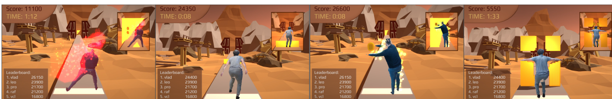
Figure 1: AVOIDX in-game screenshots. The user aims to avoid the coming carved walls by striking appropriate poses. Collisions are driven by the user’s volumetric representation instead of higher level metadata or projection-based techniques.

Center for Research and Technology Hellas, Information Technologies Institute, Visual Computing Lab